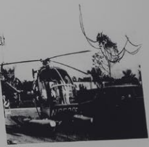
Figure 1.3 Helicopter provides an excellent means of patrolling in the air.

Except for patrolling long stretches of highway or expanses of inaccessible land, the fixed wing airplane has little flexibility in the congested metropolitan community. When distances are great and sufficient landing strips are available, the fixed wing department may find numerous occasions when the airplane will prove itself useful. In highly congested metropolitan areas, the patrol helicopter has emerged as a true champion. The helicopter has the speed, regularity of the airplane and the advantage of being able to move about easily, free of traffic congestion problems. It requires no long runway for takeoff and landing. It can operate under marginal visibility conditions at lower altitudes than the fixed wing craft, and its hovering capabilities hardly convert it into an observation platform at any desired distance from the ground. The helicopter has been employed by progressive police agencies only during the past few years, but its use in police patrol work is expanding rapidly thanks to the proven abilities of some police departments. Utilization of the helicopter system can be estimated more by financial limitations than by the limitations of the agencies' proximity to the coast.